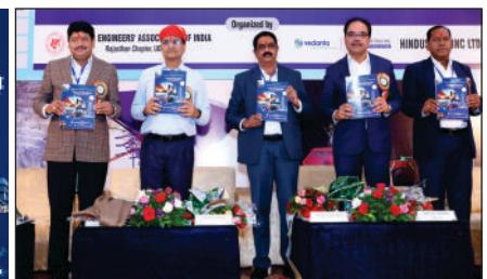
Release of Souvenir