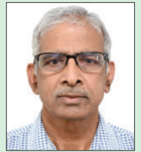
NK Kavdia Editor

The state government is taking rigorous measures to curb illegal mining and it must be appreciated. During last two months, an integrated move involving DMG, Police and Forest department officials against illegal miners is reported to have recovered ₹ 11.5 as penalty, around 750 FIRs were lodged and 456 people were imprisoned. Additionally, 71 heavy earth machineries/tools and 2,136 vehicles were also seized.